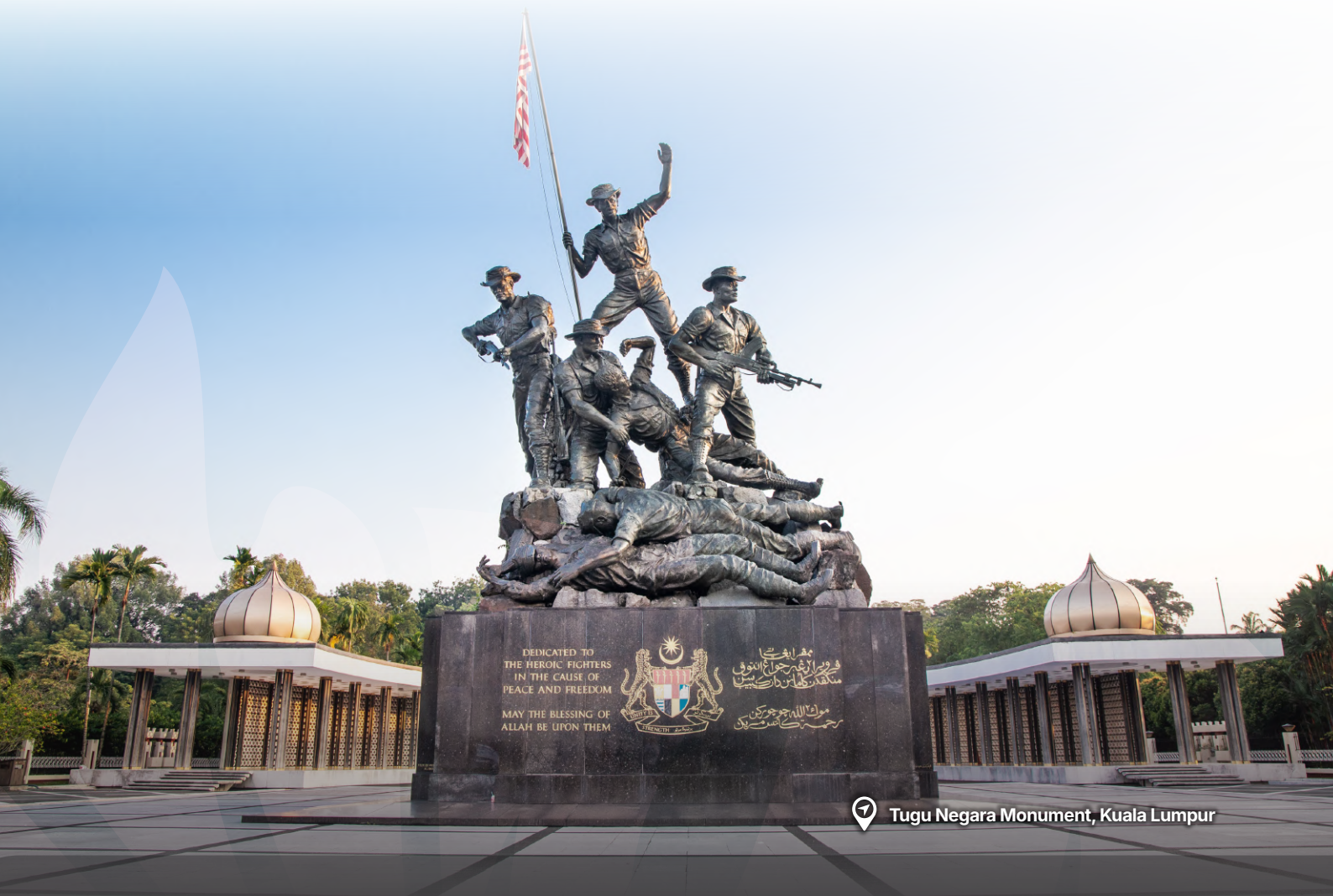
Tugu Negara Monument, Kuala Lumpur